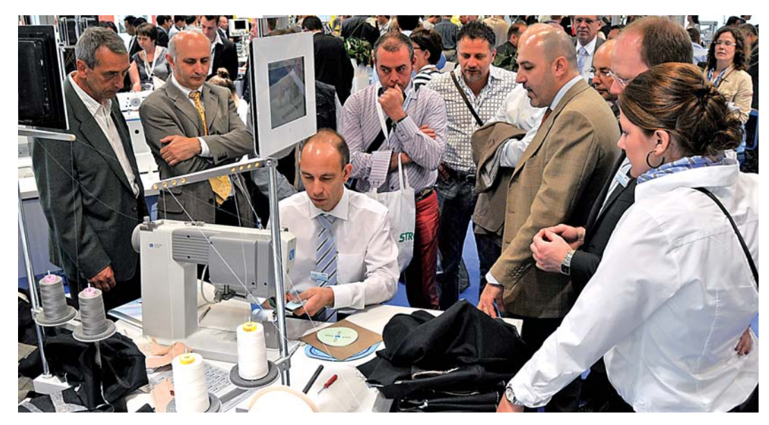
A very special highlight on the Dürkopp Adler booth was the new sleeve setting machine class DA 650 the casing of which is manufactured all of one piece.