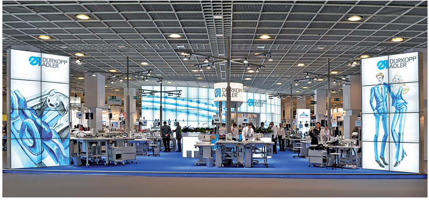
The dominating element was a huge illuminated wall showing an oversized seam intended to focus the attention of the viewer on what is essential.

The Texprocess as the leading international trade fair for the processing of textile and flexible materials celebrated a successful premiere. Also the manufacturer of sewing technology Dürkopp Adler located in Bielefeld arrived at a very positive conclusion about the exhibition. The new concept of the enterprise to focus not only on the products but also on the customers and distributors convinced the trade visitors well and truly.