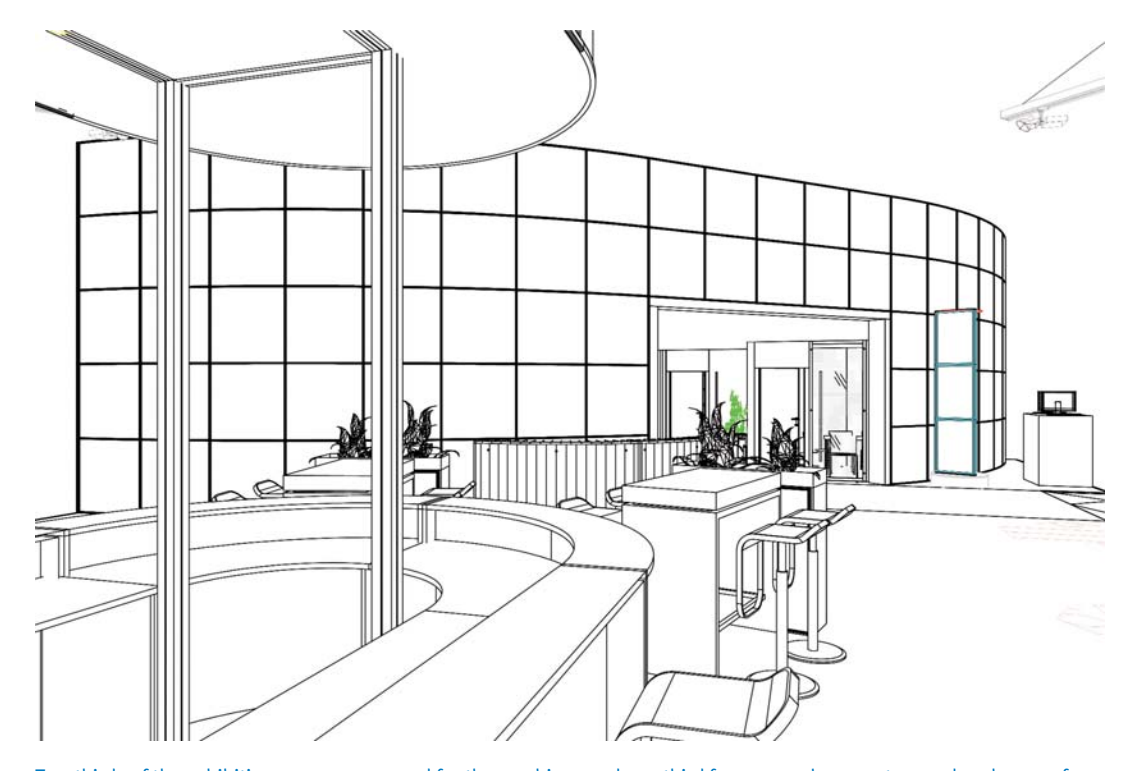
Two thirds of the exhibition area are reserved for the machines and one third for personal encounters and exchange of experience.

its debut in the segment "Apparel". This machine represents a milestone in the field of sleeve setting. What is new, too: an electronic bartacker and an electronic button attaching machine characterized by low energy consumption without compressed air. New models of high speed sewing machines will also be presented by Dürkopp Adler at the Texprocess. And last not least the brand Beisler will come to the fore again with its special machine range for the production of trousers.