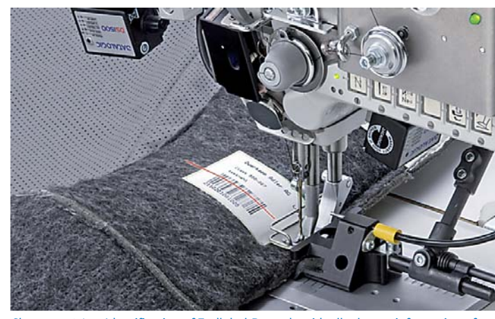
Class 550-867 – Identification of Endlabel-Barcode with all relevant information of the complete sewing process