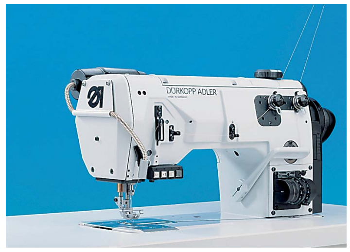
Class 195 – fast and flexible with double-chain stitch

Apart from the high ease of use and service the machines especially characterized by their superb performance parameters and their flexibility.